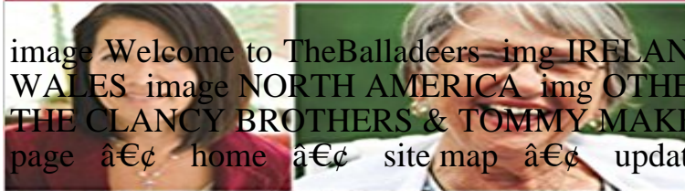
image Welcome to TheBalladeers -img IRELAND img SCOTLAND img ENGLAND img WALES image NORTH AMERICA img OTHER COUNTRIES img ANTHOLOGIES img THE CLANCY BROTHERS & TOMMY MAKEM img THE DUBLINERS welcome top of page € home € site map € updates